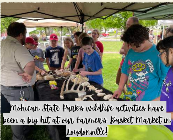
Mohican State Park's wildlife activities have been a big hit at our Farmer's Basket Market in Loudonville!