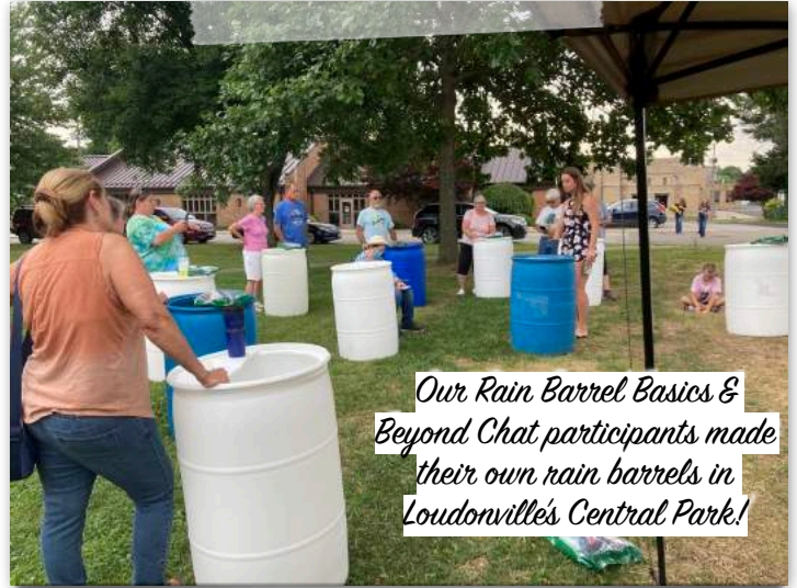
Our Rain Barrel Basics & Beyond Chat participants made their own rain barrels in Loudonville's Central Park!