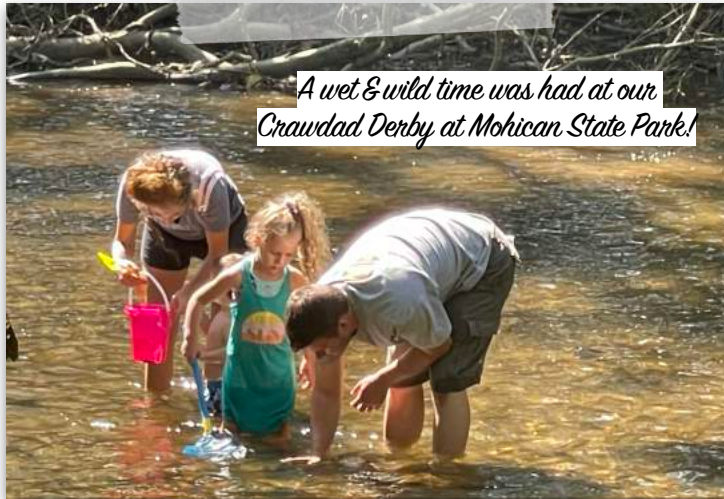
A wet & wild time was had at our Crawdad Derby at Mohican State Park!