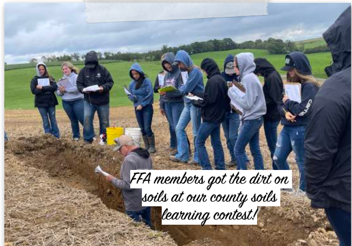
FFA members got the dirt on soils at our county soils learning contest!