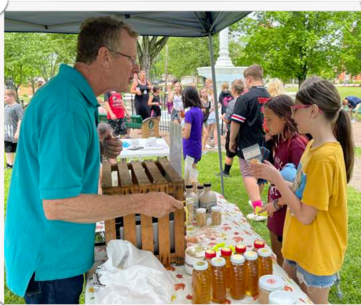
Sweet treats from Fitch's Pharm Farm were a huge hit with both young & old at the Farmer's Basket Markets this summer.

Ashland was one of just 31 conservation districts from across the country that was selected to receive an NACD Urban Agriculture grant with a focus on increasing the district's capacity to deliver technical assistance related to urban, community, and small-scale agriculture. The Ashland grant will focus on three areas: increasing