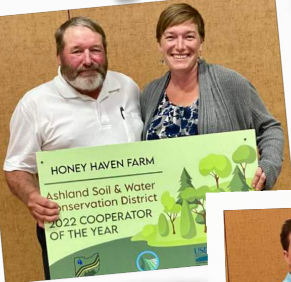
Cooperator of the Year: Honey Haven Farm